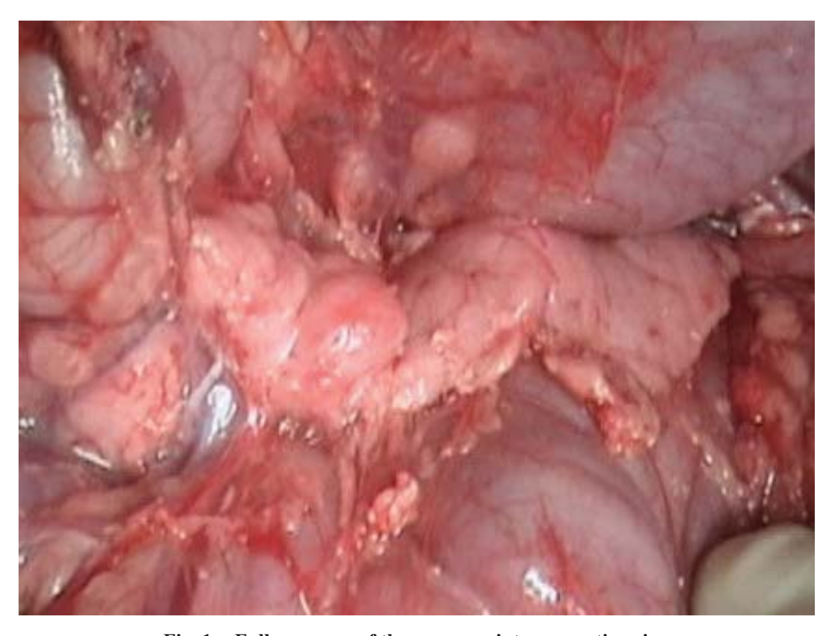
Fig. 1. Full exposure of the pancreas intra-operative view.

The surgical technique used began with wide upper abdominal incision. Pancreas was then approached in the bed of the lesser sac through the divided gastrocolic ligament, with the securing divided blood vessels then mobilizes the duodenum. Then, expose the head, body and tail of the pancreas (Fig. 1). In all of the patients, the pre-operative radiological ultrasound and CT scanning of the pancreas were of normal finding and intra-operative inspection, and palpation of the whole pancreas did not indicate any focal swelling or nodularity. Intra-operative biopsies were taken for frozen-section histopathology to confirm the diffuse nature of the condition. A near-total pancreatectomy (95%) in all operated patients (Fig. 2) starting pancreatic mobilization from tail to body saving the spleen was performed. Utilizing bipolar coagulation in short pancreatic vessels crossing dividing its upper